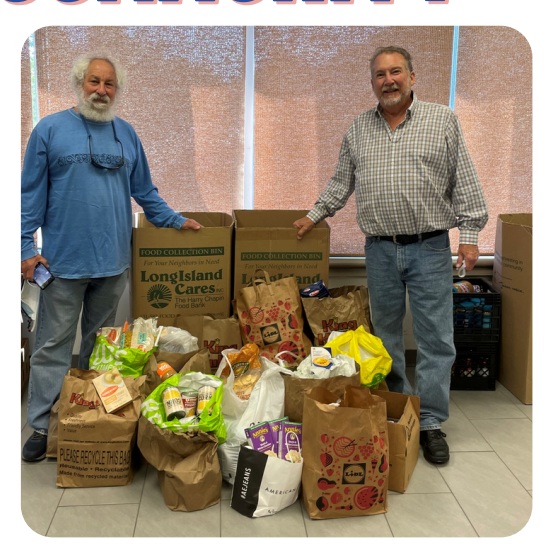
JCM received the following letter in appreciation of our High Holiday food drive:

Long Island Cares, Inc., The Harry Chapin Food Bank gratefully acknowledges receipt of a total of 277 pounds of food donated by the Jewish Center of the Moriches on October 1, 2021.